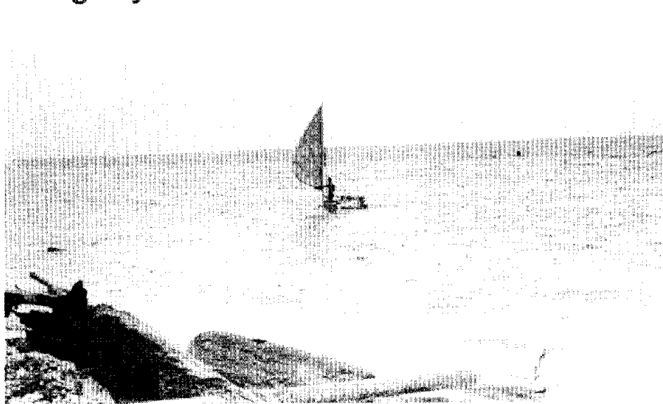
ILLUSTRATION: The ocean is God's power and glory