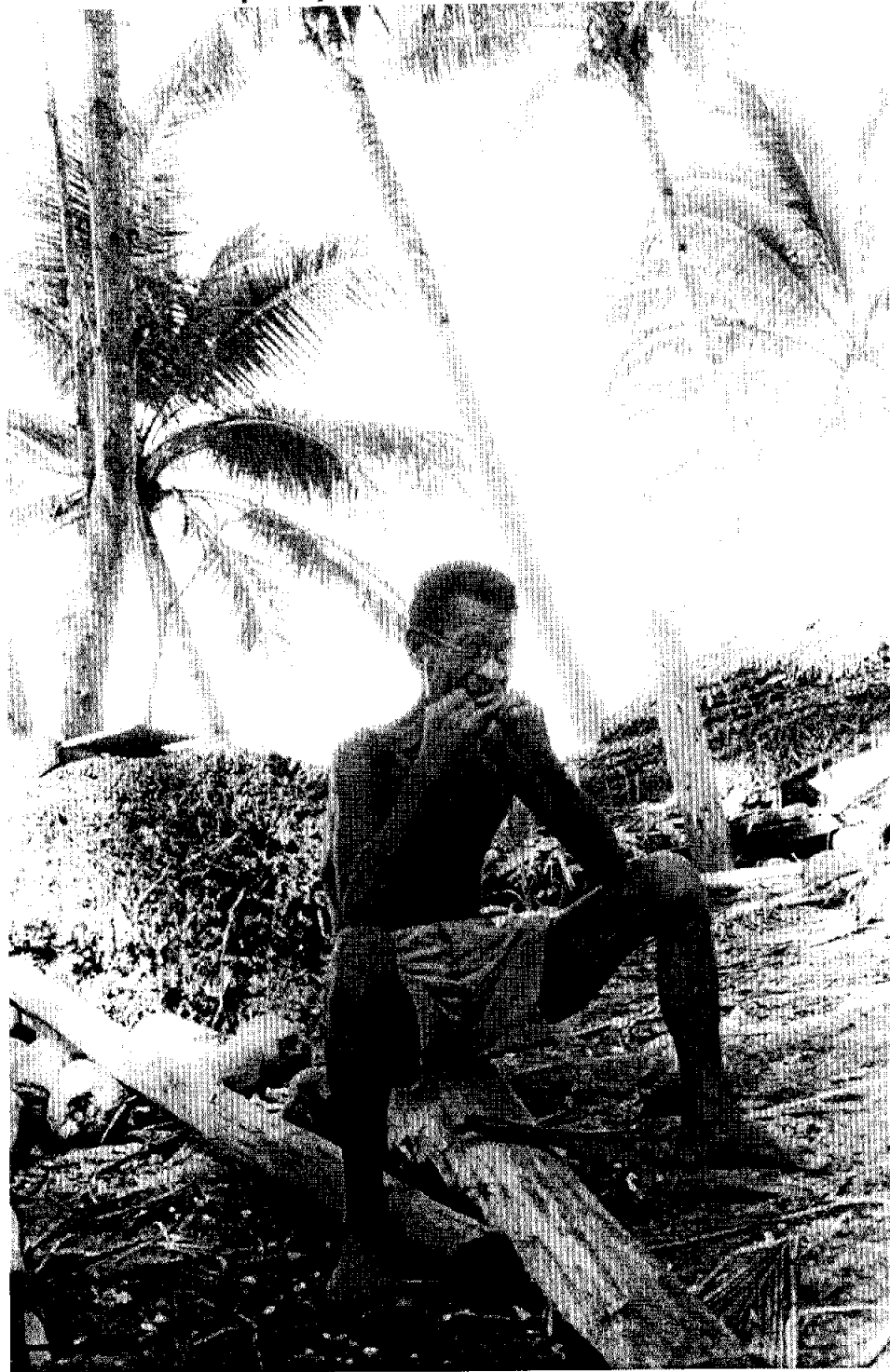
ILLUSTRATION: The Chief was called the father of the island, as God is father of all the world's people.