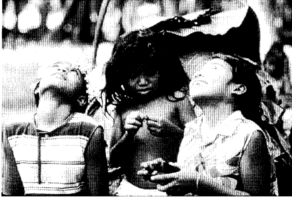
ILLUSTRATION: Sisters come together and make peace with each other