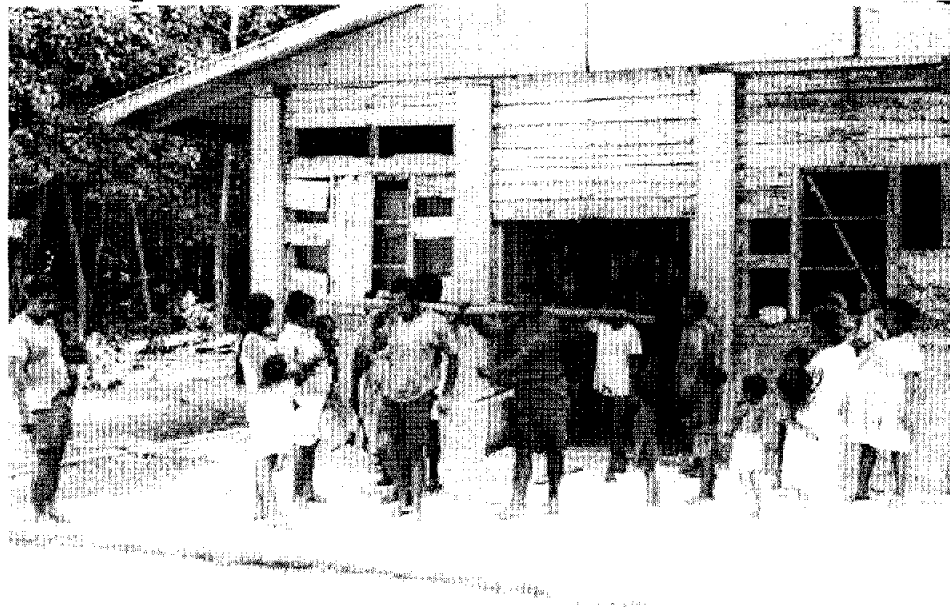
ILLUSTRATION: At this man's funeral, asking God to carry him away from evil