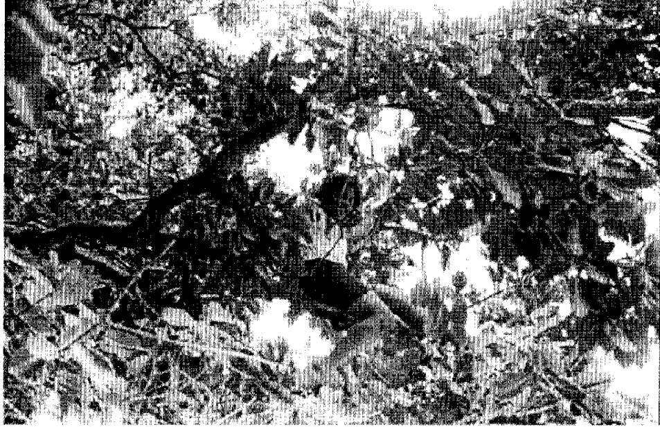
ILLUSTRATION: Breaking one of the rules of Tobian culture