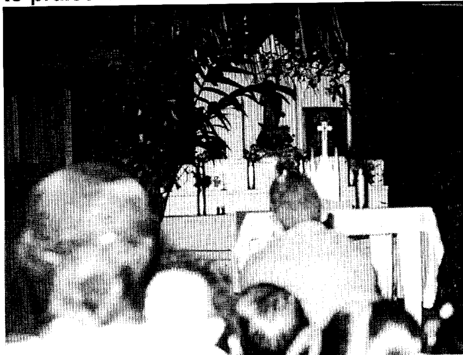
ILLUSTRATION: People in church praying to praise God's name.