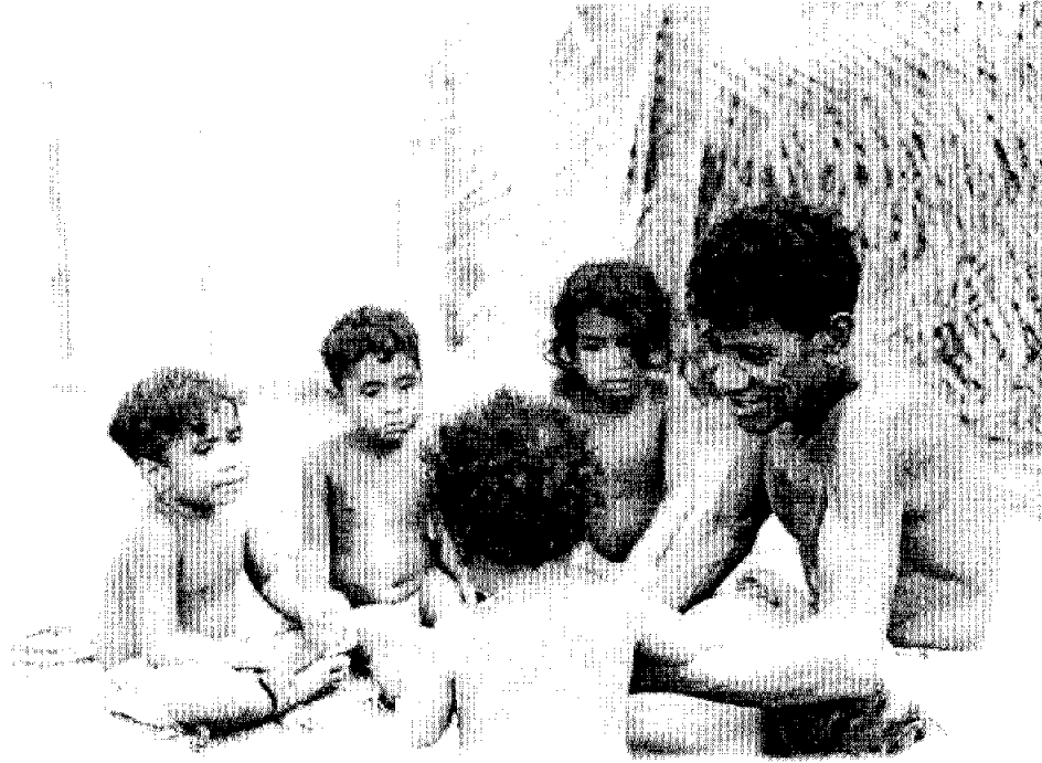
ILLUSTRATION: Babies are holy, earthly creatures