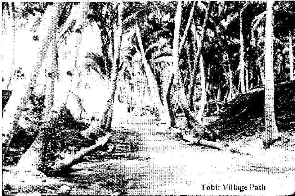
Tobi: Village Path