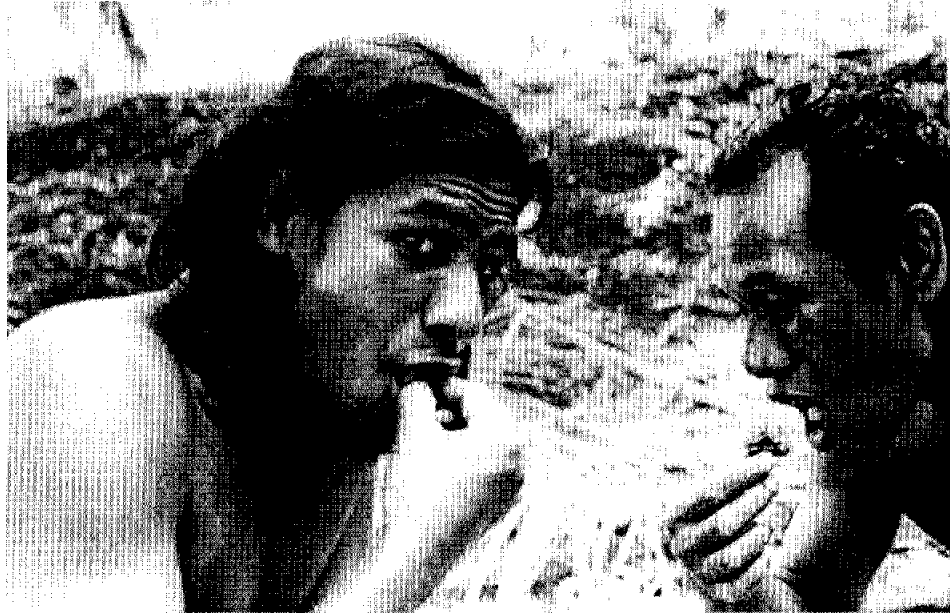
ILLUSTRATION: My Grandfather with his daily bread