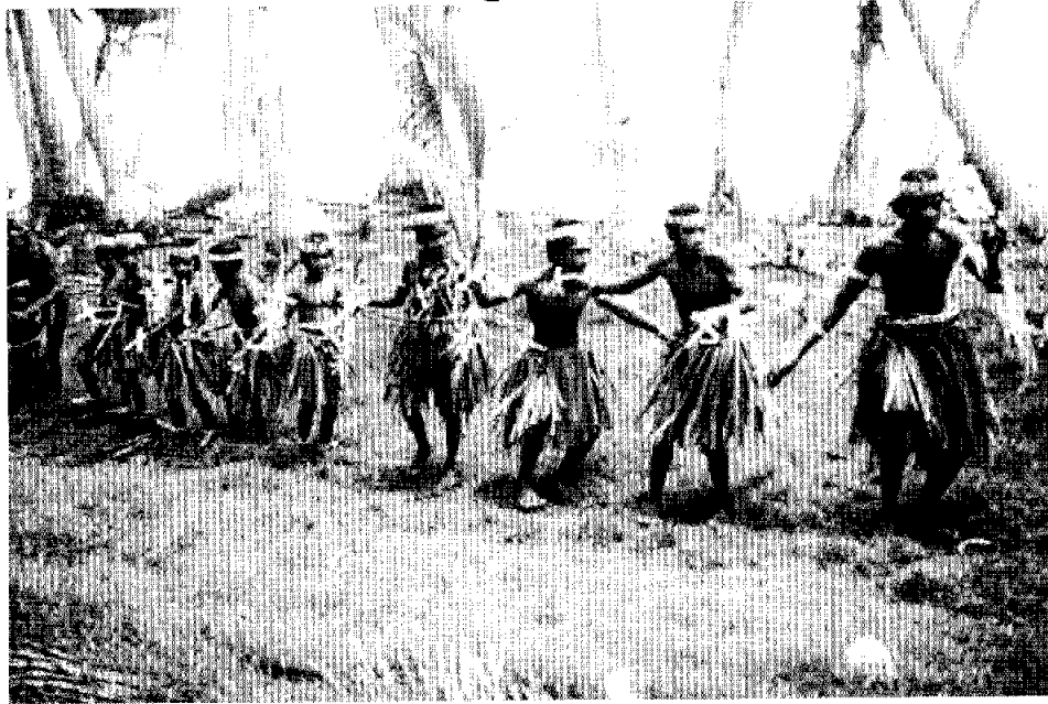
ILLUSTRATION: Dancing at Christmas to celebrate God's Kingdom